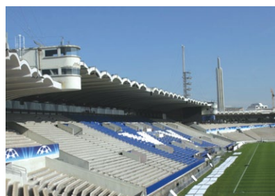
■ Rehabilitation complex structure RC Chaban Delmas Stadium