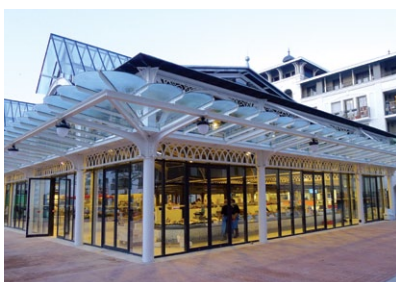
■ Technical facades and complex metal framework Arcachon market (33)