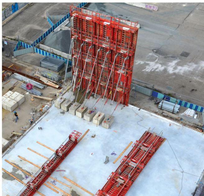
■ Great height shells Boiler plant Bordeaux (33)